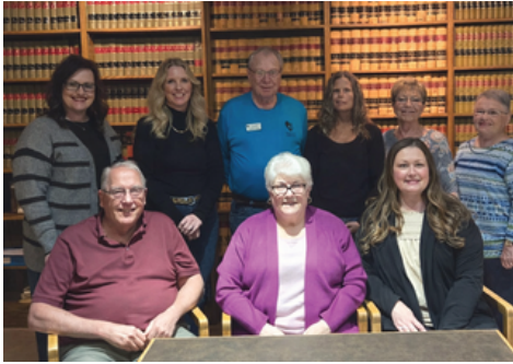
2026 Board of Directors